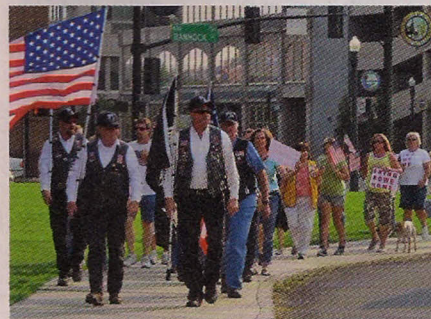
Lions and others march in Boise to show support for Sgt. Bergdahl.