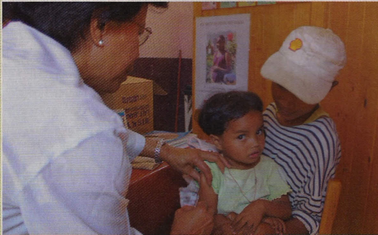
A child in Madagascar is vaccinated against measles thanks to the Lions-Measles Initiative.

Lions are partnering with the Bill & Melinda Gates Foundation to protect 41 million African children from measles. The goal of the Lions-Measles Initiative is to vaccinate at least 95 percent of children aged 9 months to 47 months old in Ethiopia, Madagascar, Mali and Nigeria. LCIF and the Gates Foundation are jointly funding the $750,000 program. Vaccinations began in October. Lions in Africa are publicizing the measles campaign, mobilizing people for vaccinations and working closely with government health officials. Measles is the leading cause of vaccine-preventable death in children. It also can cause blindness. UNICEF estimates 1.7 million children could die from the disease in the next three years if vaccination efforts subside. The Lions' effort is part of the Measles Initiative, which has led to more than 700 million children being vaccinated since 2001. The Measles Initiative is supported by UNICEF, WHO, U.S. Centers for Disease Control, American Red Cross and the United Nations Foundation.